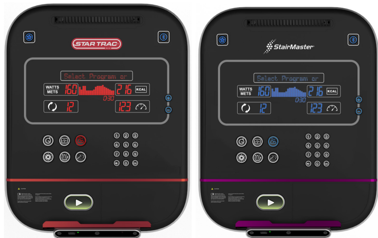
SKU(s): 700-0283-XX + 700-0396-XX + 700-0303

On the keypad, press "0", "2", and "OK" at the same time, then use the hotbar to change the menu selection and "OK" to enter that sub-menu.