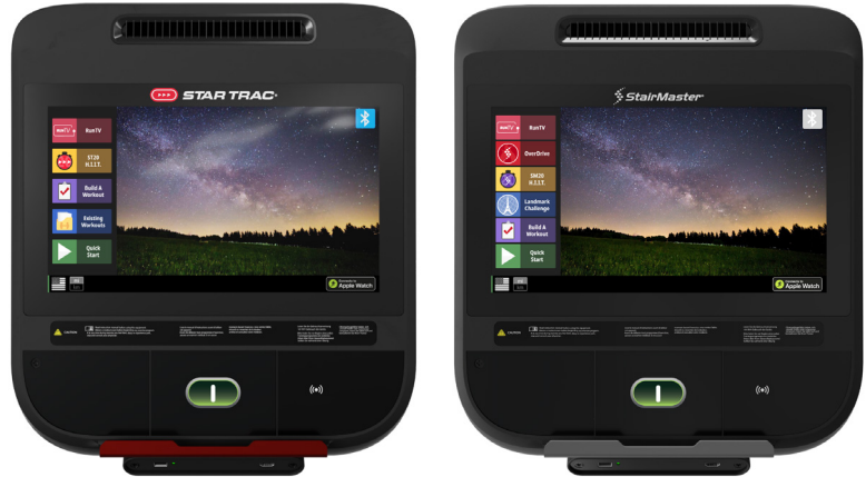
SKU(s): 700-0471-XX + 700-0472-XX + 700-0468-XX + 700-0469-XX