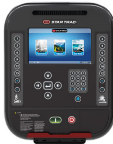
SKU(s): 700-0464-XX + 700-0465-XX