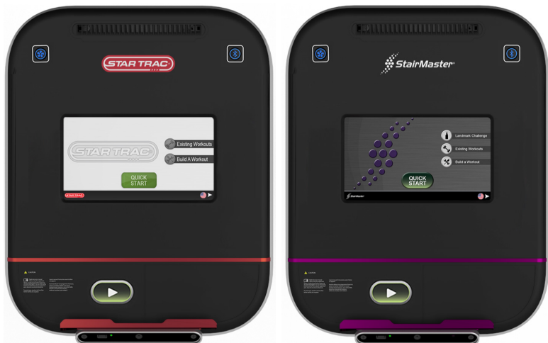
SKU(s): 700-0378-XX + 00-0380-XX

Tap the upper left corner of the screen, then the center of the screen, then the upper left corner of the screen to access the maintenance menu.