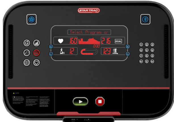
SKU(s): 700-0360-XX + 700-0282-XX

On the keypad, press “0”, “2”, and “OK” at the same time, then use the hotbar to change the menu selection and “OK” to enter that sub-menu.