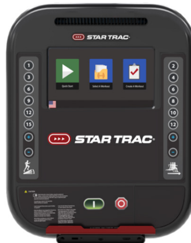
SKU(s): 700-0506-XX + 700-0507-XX

Tap the upper left corner of the screen, then the center of the screen, then the upper left corner of the screen to access the maintenance menu.