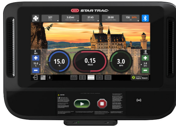
SKU(s): 700-0463-XX + 700-0466-XX